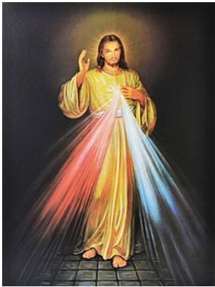
St Faustyna Kowalska (1905-1938) Diary entry n.950

“Eternal God, in whom mercy is endless, and the treasury of compassion inexhaustible, look kindly upon us, and increase your mercy in us, that in difficult moments, we might not despair, nor become despondent, but with great confidence, submit ourselves to Your holy Will, which is Love and Mercy itself.”