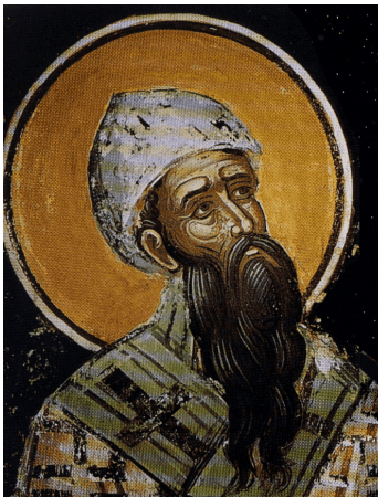
St Cyril of Alexandria (c.376-444) Bishop and Doctor of the Church Commentary on St John's Gospel

“Christ did not receive the Spirit for himself, but rather for us in himself: for all good things flow through him also into us.”