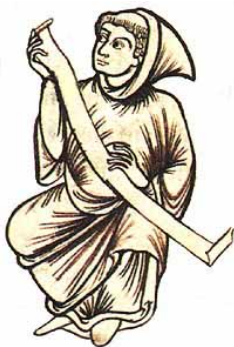
St Aelred of Rievaulx (1110-1167) Abbot of Rievaulx Abbey, England Spiritual Friendship

“I call them beasts more than men who say life should be led so that they need not console anyone nor occasion distress or sorrow to anyone, who take no pleasure in the good of another, nor expect their failures to distress others, seeking to love no one and be loved by none.”