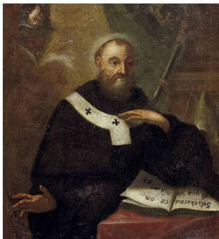
St Fulgentius of Ruspe (c.465 - c. 530) Abbot, bishop and theologian

Christ our Lord, brethren, set up for us this ladder of love, and by it every Christian can climb to heaven. You must, therefore, keep a firm hold on love, you must show it to one another, and by progress in it climb up to heaven.”