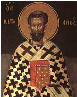
St Cyprian of Carthage (c.210 - 258) Bishop, Theologian and Martyr

“Let us also arm our right hand with the sword of the Spirit, so that it may bravely reject the sacrifices of death; so that this right hand which receives the body of the Lord, may, mindful of the eucharist, embrace him, and afterwards may receive the prize of the heavenly crown from the Lord.”