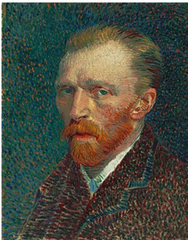
Vincent van Gogh (1853 - 1890) Dutch artist

"I think that everything that is really good and beautiful, of inward moral, spiritual, and sublime beauty in people and their works, comes from God."