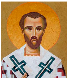
St John Chrysostom (c.347 - 407) Bishop & Doctor of the Church Homilies on Ephesians

“The love of husband and wife is the force that welds society together. Men will take up arms and even sacrifice their lives for the sake of this love. When harmony prevails, the children are raised well, the household is kept in order, and neighbours, friends, and relatives praise the result. Great benefits, both of families and states, are thus produced. When it is otherwise, however, everything is thrown into confusion and turned upside-down.”