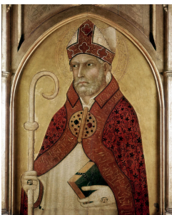
St Augustine of Hippo (354 - 430) Bishop & Doctor of the Church Confessions

"Nothing should be held true merely because it is eloquently expressed, nor false because it sounds harsh upon the lips. And a thing is not true because rudely uttered, nor is it false because its utterance is splendid. I have learned from you that wisdom is like wholesome food and folly like unwholesome food: they can be set forth in language ornate or plain, just as both kinds of food can be served on rich dishes or on peasant ware."