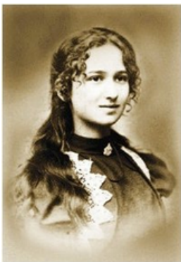
Raissa Maritain (1883 - 1960) Poet and Contemplative Journal

"I have the feeling that what is asked of us is to live in the whirlwind, without keeping back any of our substance, without keeping back anything for ourselves, neither rest nor friendships nor health nor leisure - to pray incessantly...in fact, to let ourselves pitch and toss in the waves of the divine will till the day when it will say: 'That's enough.'"