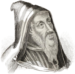
St Augustine of Hippo (354 - 430) Bishop and Doctor of the Church Introduction to a Sermon to the newly baptised

“I address myself to you, newly-baptised infants, little ones in Christ, new offspring of the Church, grace of the Father, fruitfulness of the Mother’s womb, holy children, new swarm, flower of our honour, and fruit of our labour, my joy and my crown, all of you who stand upright before the Lord...”