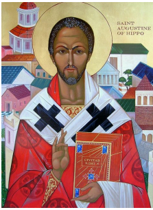
St Augustine of Hippo (354 - 430) Bishop and Doctor of the Church

“Trust the past to God's mercy, the present to God's love, and the future to God's providence.”